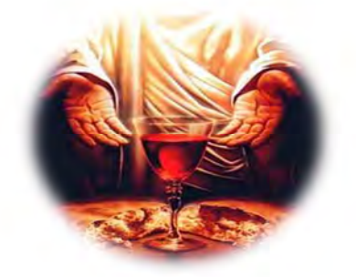
Thursday Night 7:30 P.M.

Praise and Worship Presiding Opening Song Scripture Prayer Song Introduction of Preacher Selection